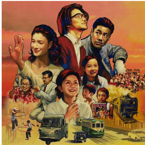
©2005 NTV/ ROBOT/ SHOGAKUKAN/VAP/ TOHO/ DENTSU/ THE YOMIURI SHINBUN/ SIROGUMI/ IMAGICA